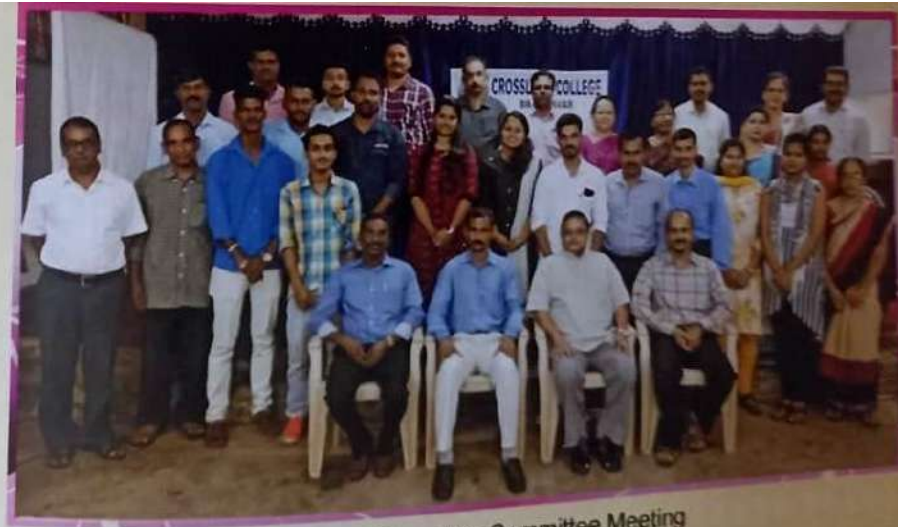
Alumni Executive Committee Meeting