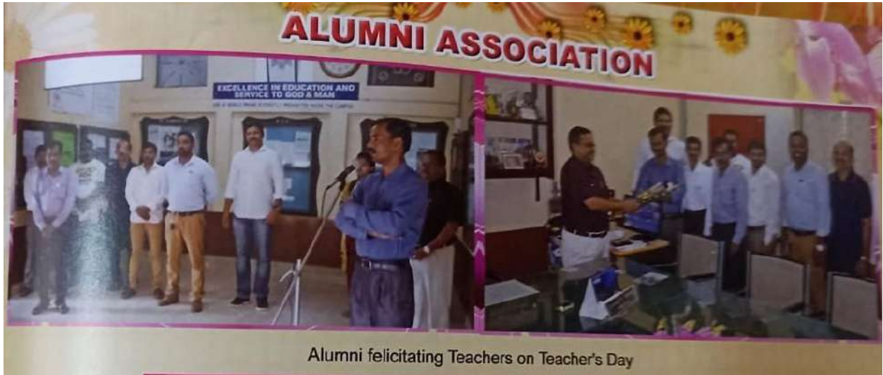
Alumni meeting by Bangalore Chapter