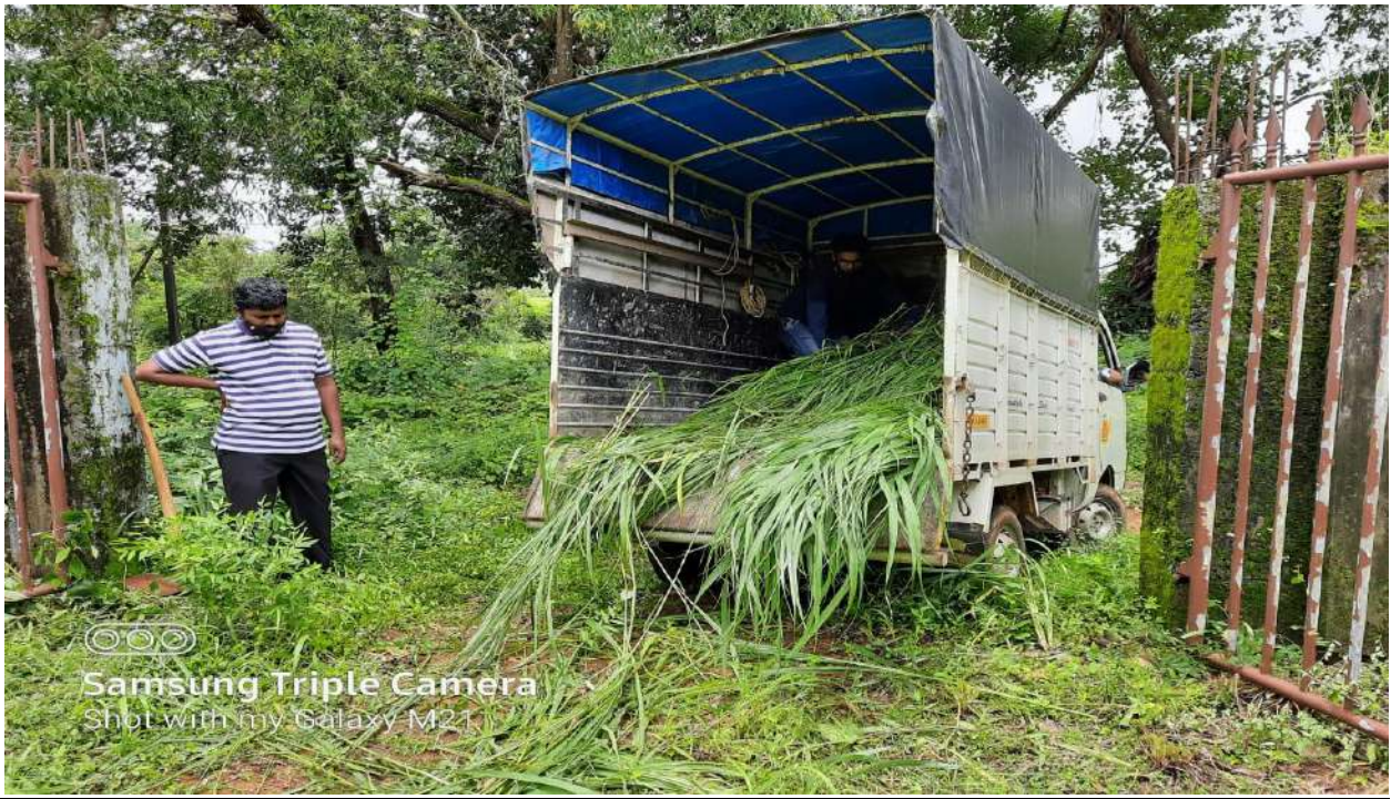
©©© Samsung Triple Camera Shot with my Galaxy M21