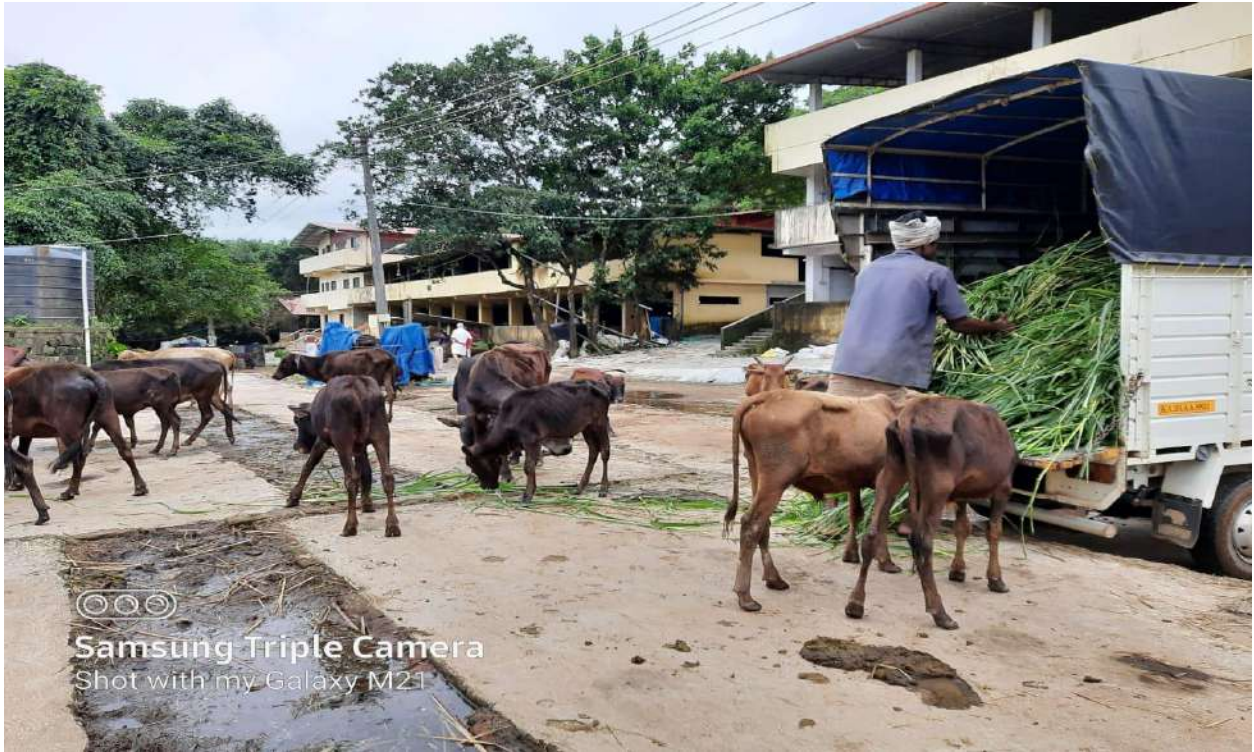
©©© Samsung Triple Camera Shot with my Galaxy M21