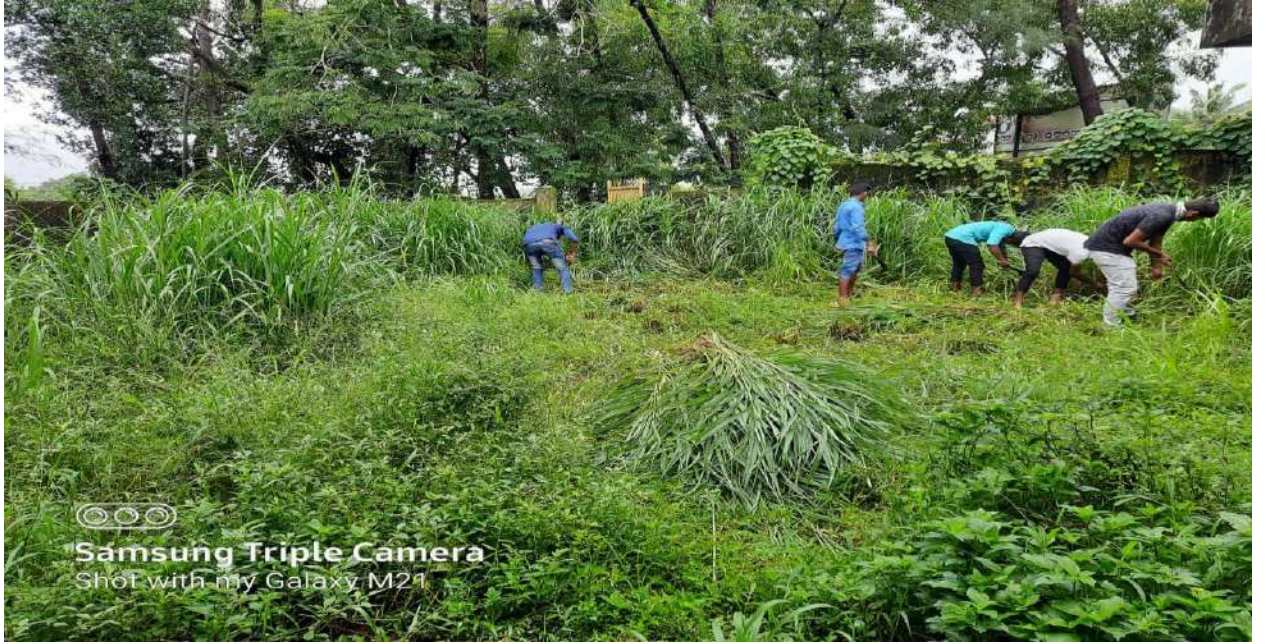
©©© Samsung Triple Camera Shot with my Galaxy M21