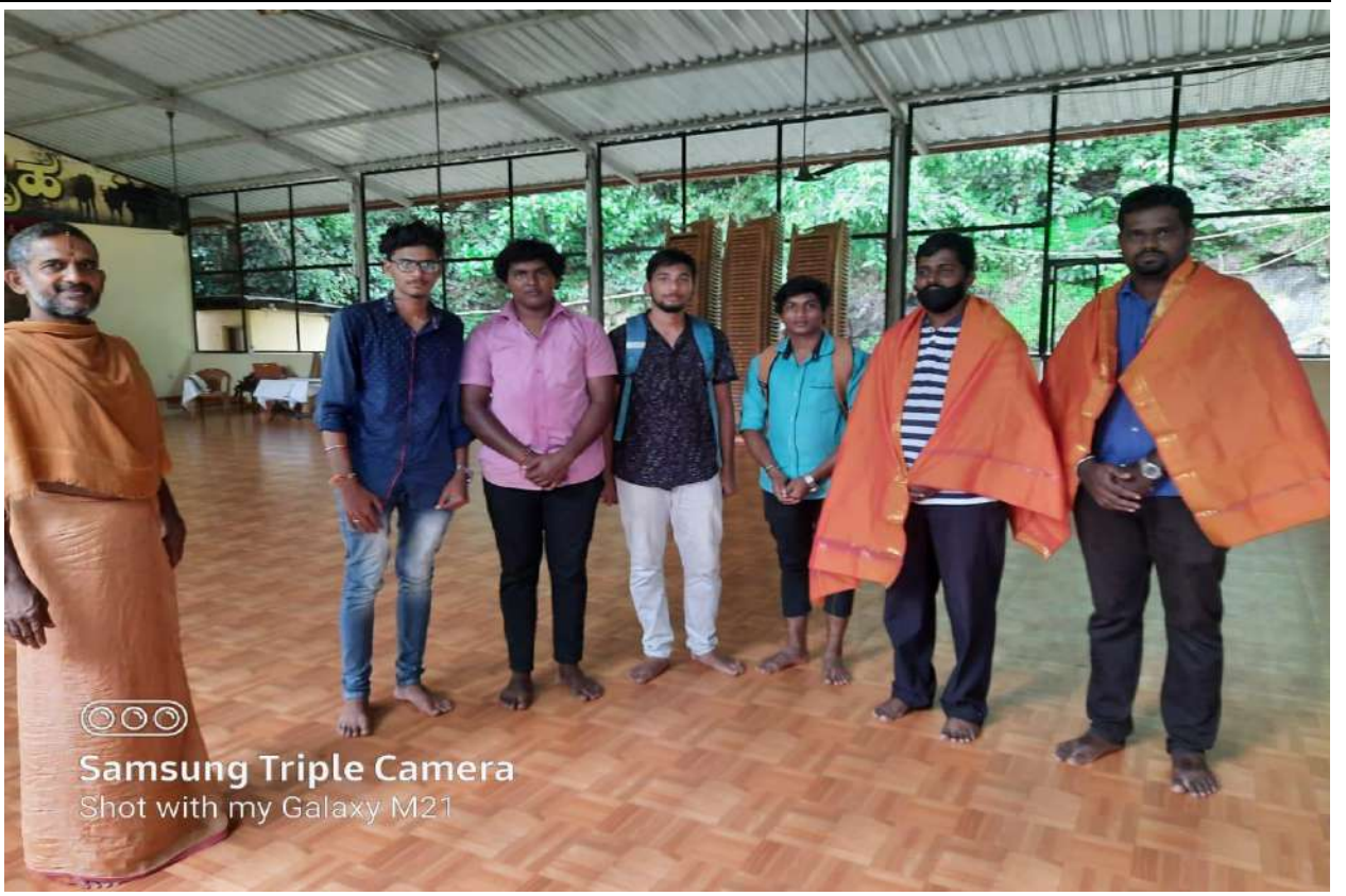
©©© Samsung Triple Camera Shot with my Galaxy M21