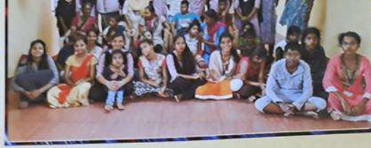
R.D. Students' Visit to SUMEDHA, a home for the mentally challenged, Neelavara.