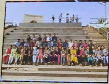
Study Tour - Commerce Students