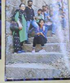
Study Tour - History Students