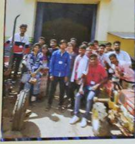
Industrial visit by SP students