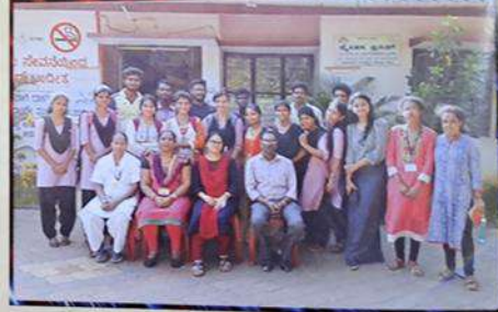
R.D. Students' Visit to PHC Pethri.