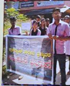
Students at Alupotsava, Barkur